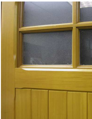
Glazing details of a Sherwood Southwell showing glazing bar details, the windows in this door are a solid window sash inserted into the door panel as shown.