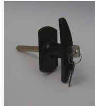
Standard "T" handle