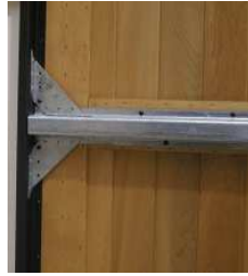
Strong steel lateral bracing with steel corner joints