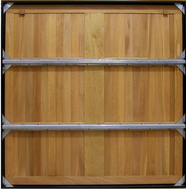
Inside view of a Sherwood door showing the outer aluminium boundary frame together with the galvanised steel lateral bracings and steel corner joints.