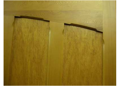
Panel detail of plywood panelled doors with cedar facings showing stopped chamfer profile.