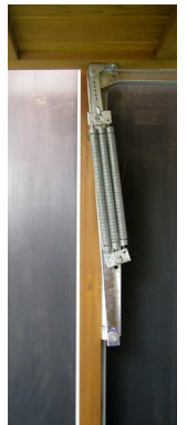
High lift spring system on doors up to 8'0 x 7'0 maximising drive through clearance for most vehicles.