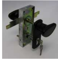
Security Euro Locking ( optional )